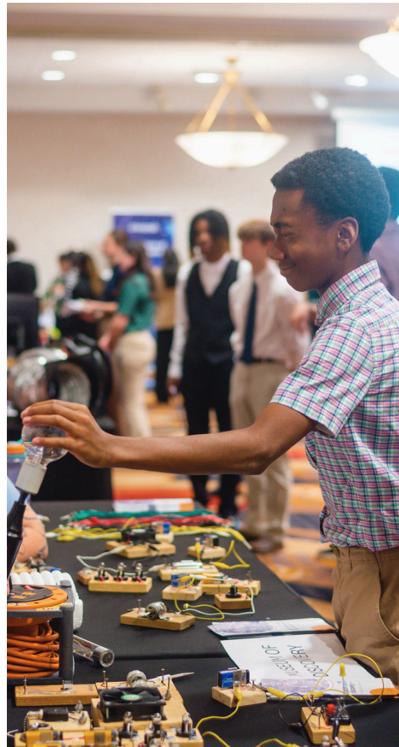
An image of Empower Expo 2025.

The Solution: Combining a standardized C-PACE financing mechanism with AAEF's "SkillStream" model, a career pipeline for advanced energy jobs, thus creating a localized ecosystem where funded projects will ultimately translate into high-quality jobs for the community.